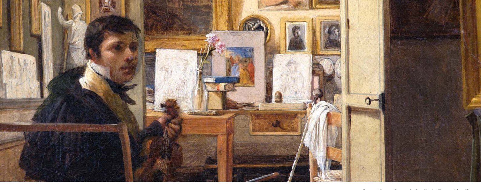
Press Release 14 february 2024

Jean Alaux, Ingres's Studio in Rome (detail)